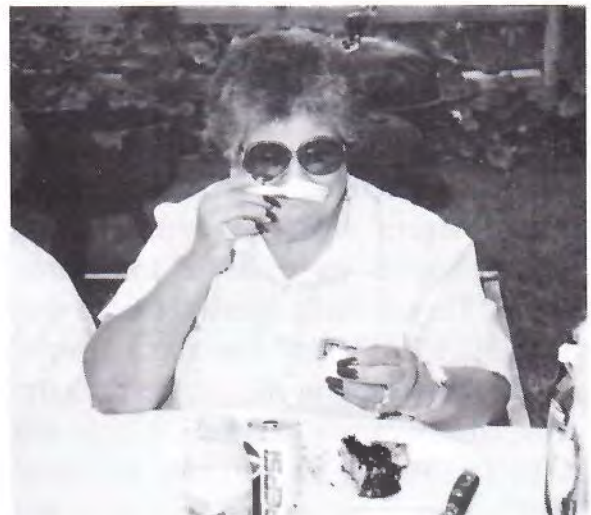
Authoress with fork!