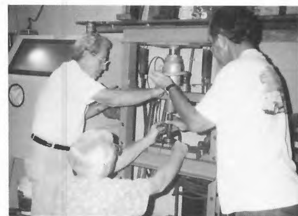
Do too many mechanics spoil the transmission?

Lots of great pictures had to be left out We hope for more room next month.