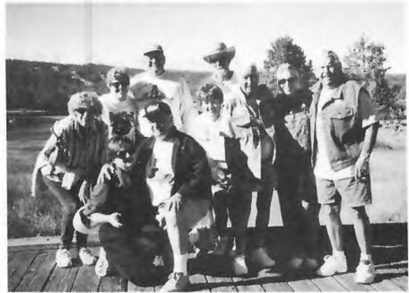
The gangs almost all here...