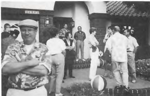
Arm folding contest at Progressive Dinner