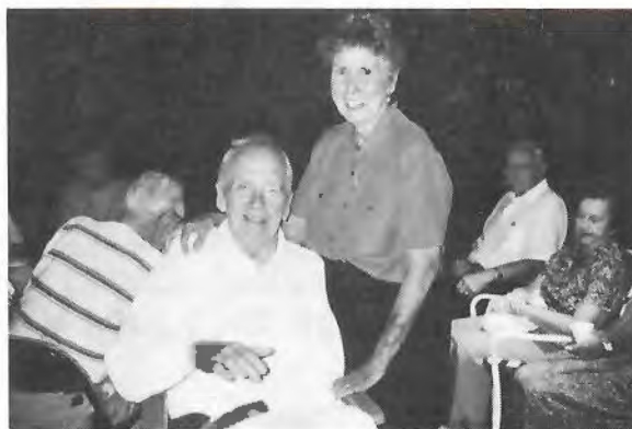
Dessert at the Wavra's -