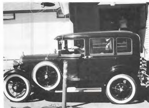
Gymkana or kan'ta